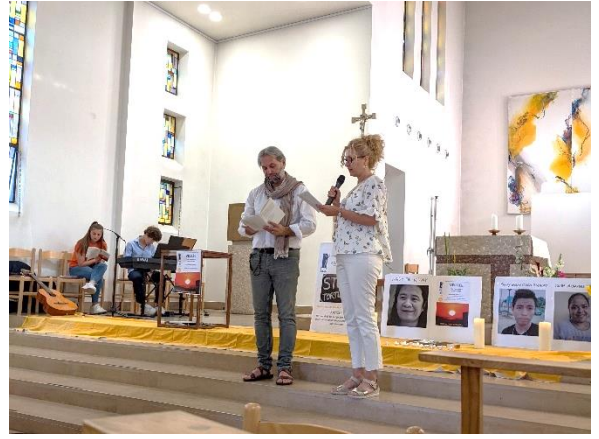
Nuit des Veilleurs 2023 at the Chapelle du Christ-Roi