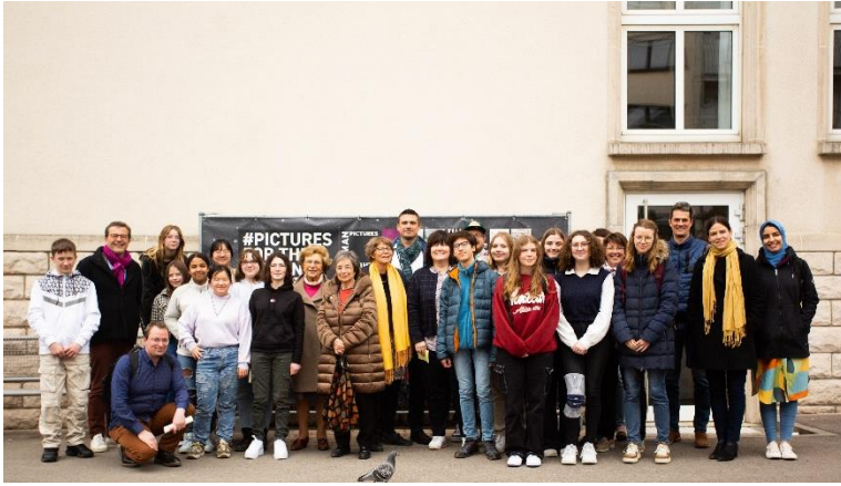
“Pictures for the Human Rights” at École Privée Fieldgen from April 18th until May 16th