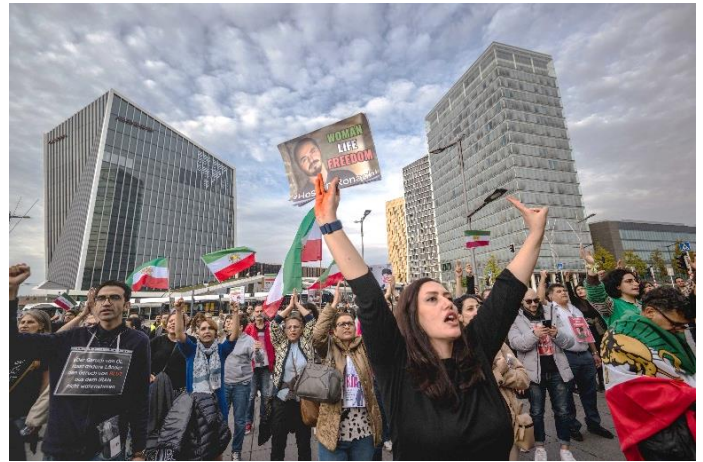
Manifestation Luxembourg, Woman Life Freedom 2022